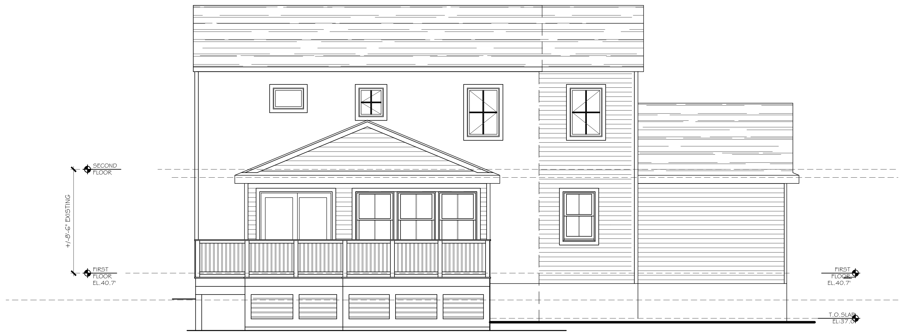
1 PROPOSED EXTERIOR ELEVATION -REAR YARD 1/4"=1'-0"

Sinkovich Residence 171 HILLSIDE DRIVE SHARK RIVER HILLS NEPTUNE TWP., NEW JERSEY LOT: 1 BLOCK 4915