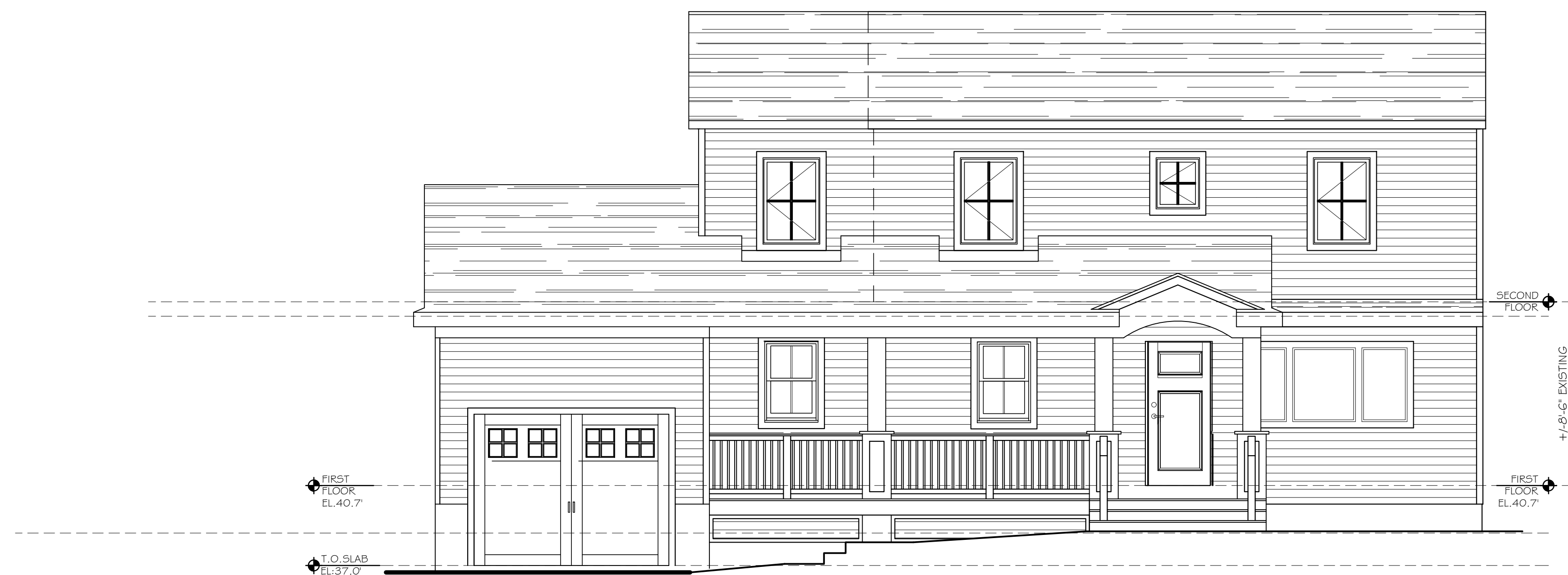
1 PROPOSED EXTERIOR ELEVATION -STREET 1/4" = 1'-0"

Sinkovich Residence 171 HILLSIDE DRIVE SHARK RIVER HILLS NEPTUNE TWP., NEW JERSEY LOT: 1 BLOCK 4915