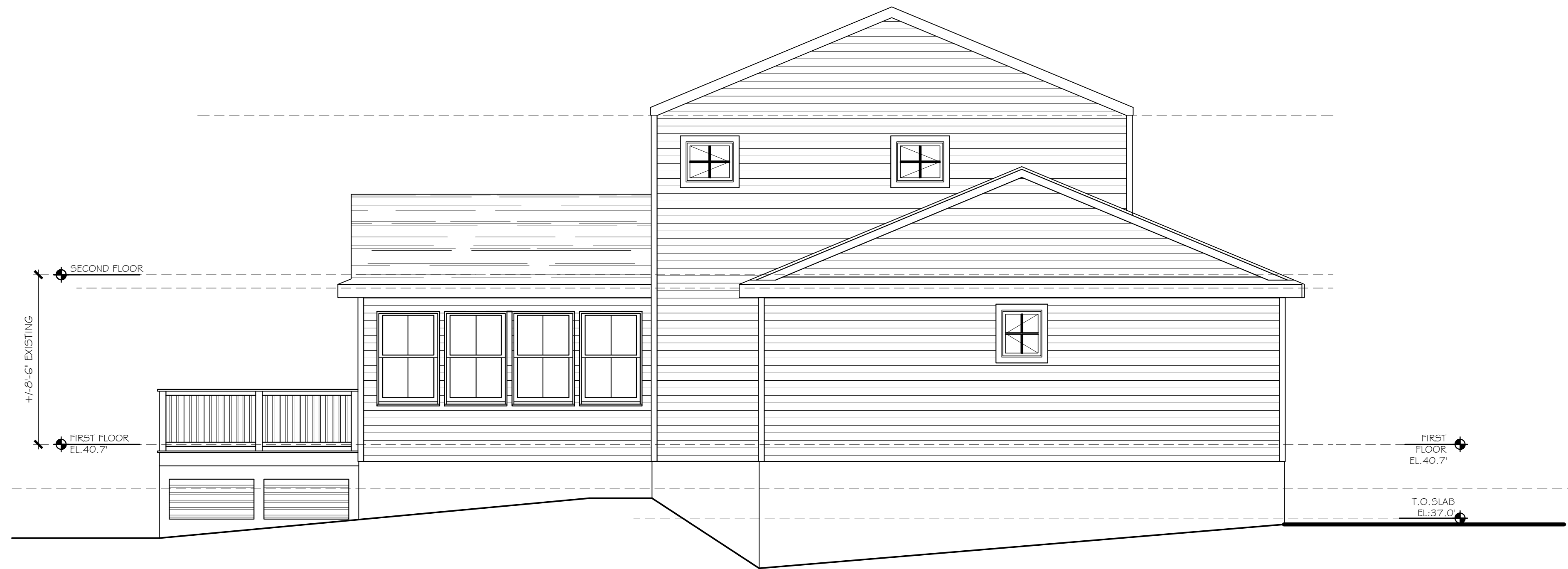
2 PROPOSED EXTERIOR ELEVATION -SIDEYARD - NORTH 1/4" = 1'-0"

© N2 Architecture LLC 2022. N2 Architecture LLC reserves its common law copyright and other property rights in these plans. These documents are not to be reproduced, changed or copied in any form or manner whatsoever nor are they to be assigned to a third party without first obtaining the expressed written permission of N2 Architecture LLC.