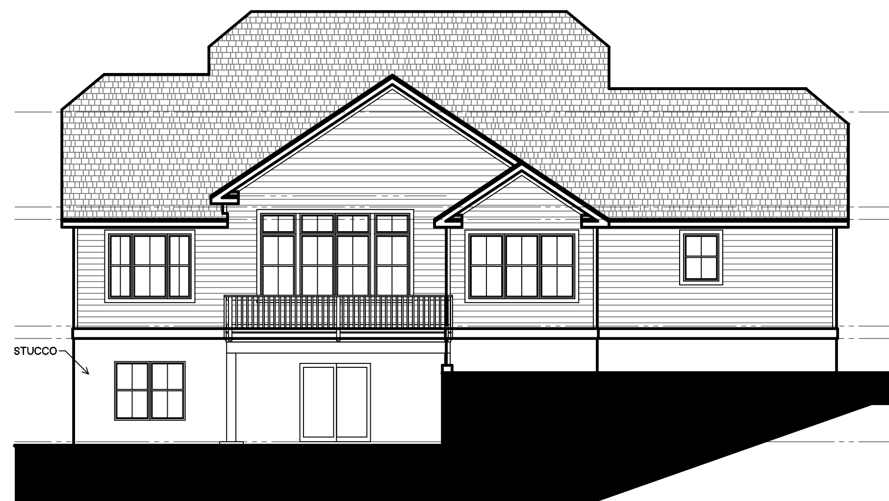
Rear Elevation Scale: 1/8"=1'-0"