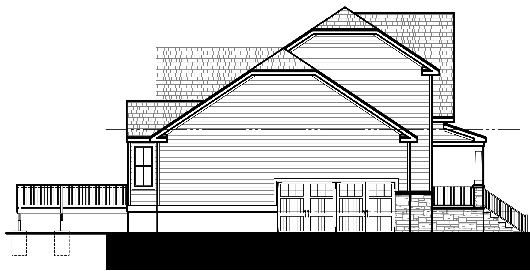
Left Elevation Scale: 1/8"=1'-0"