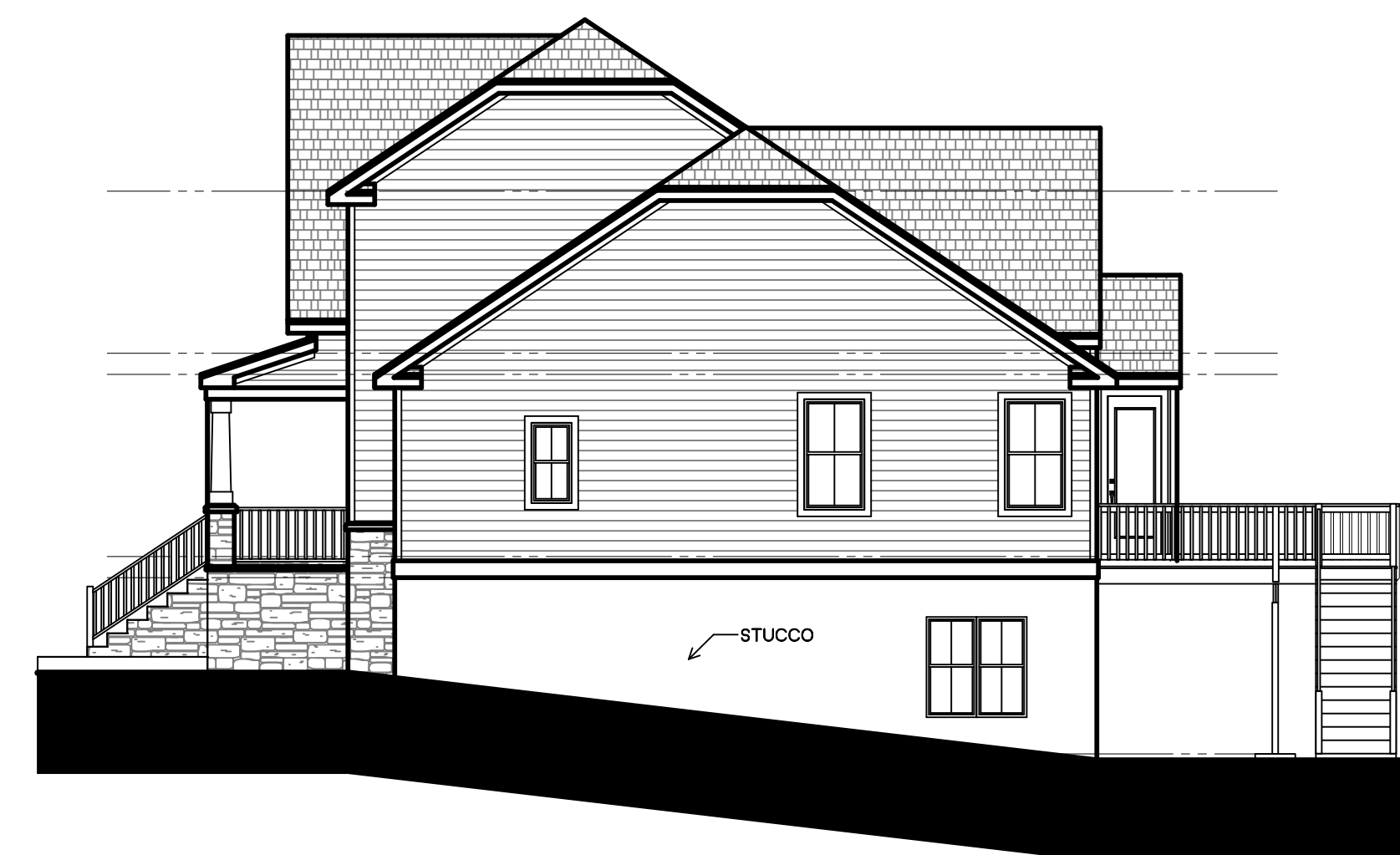
Right Elevation Scale: 1/8"=1'-0"

Managed By: CLH Drawn By: Checked By: Redlined By: Date: Issue For Permit: Issue For Review: 2020-12-03 Issue For Construction: Revisions: