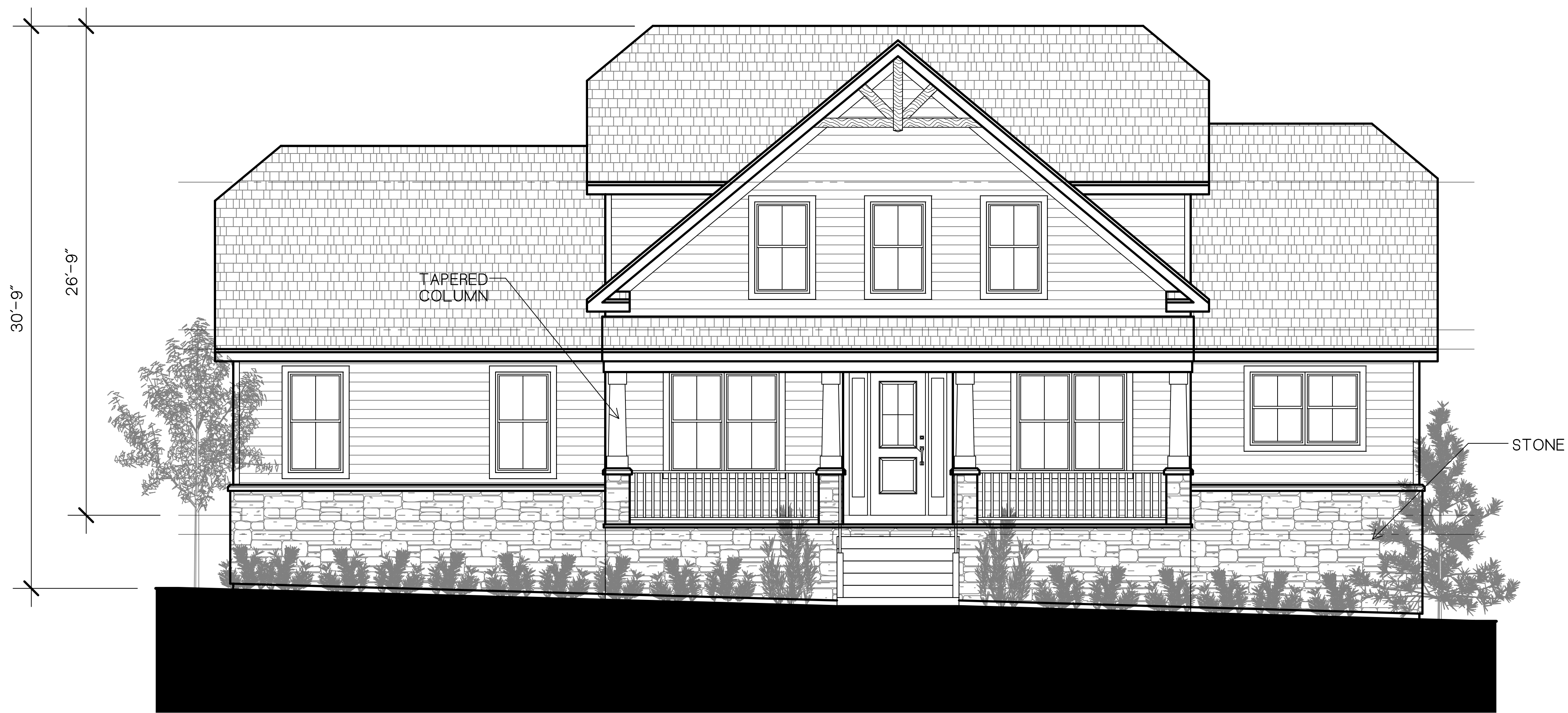
Front Elevation Scale: 1/4"=1'-0"