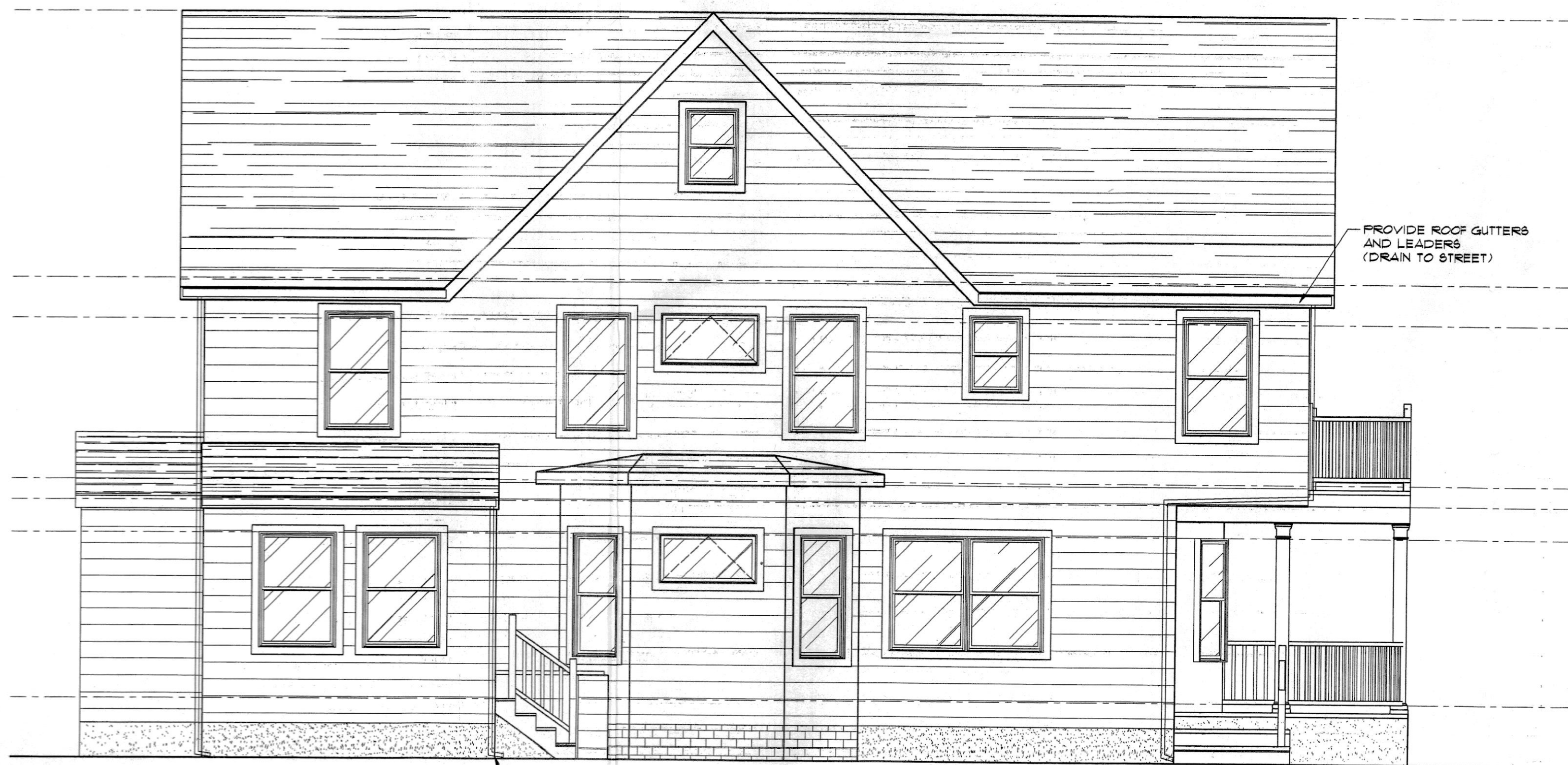
LEFT SIDE ELEVATION SCALE: 1" = 20'-0"