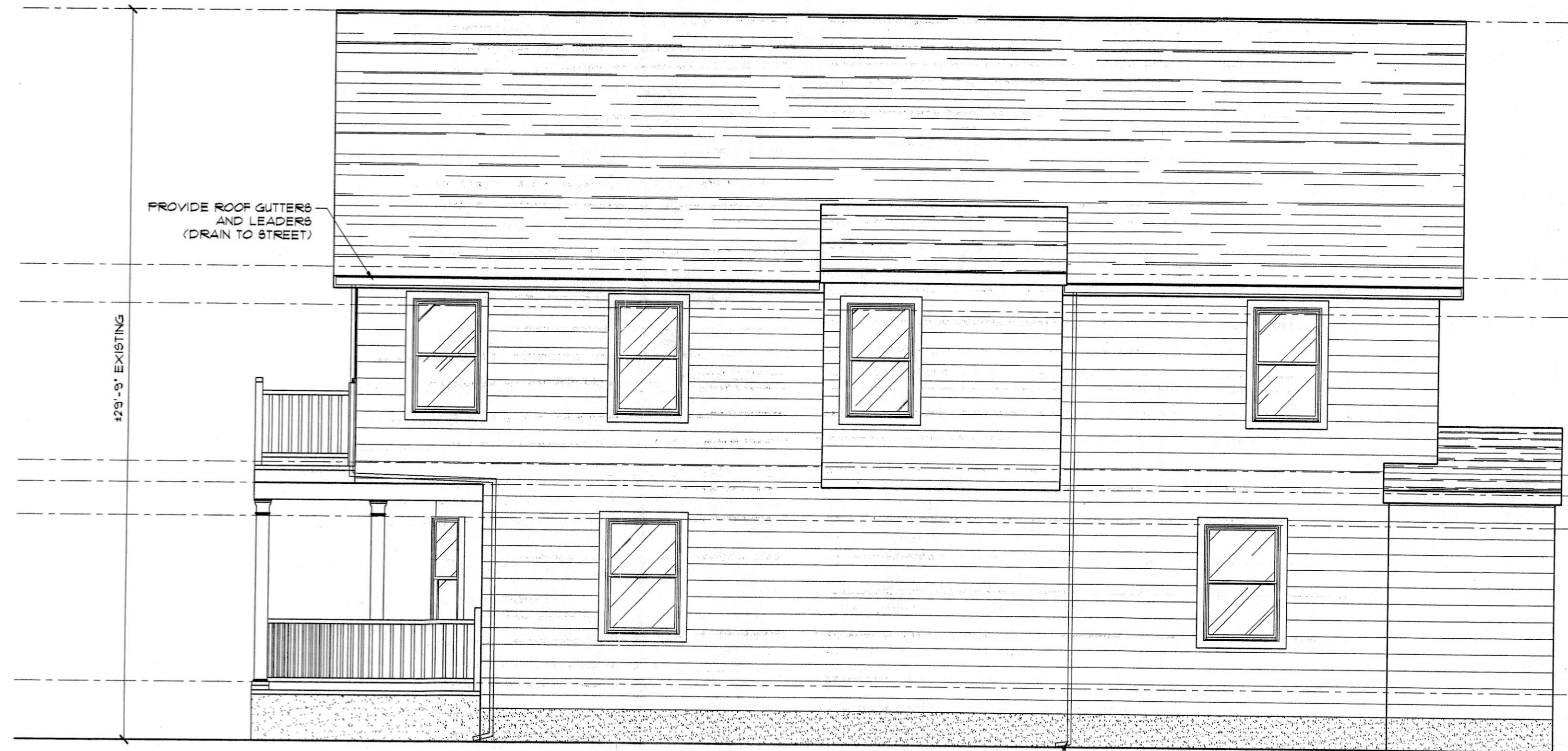
RIGHT SIDE ELEVATION SCALE: 1" = 20'-0"

ANTHONY M. CONDOURIS ARCHITECT 20 BIRNINGHAM AVENUE, RUMSON, NJ 07760 Phone: 732-842-3800 ~ fax: 732-842-7777 ~ email: info@amcarchitect.com ~ www.amcarchitect.com