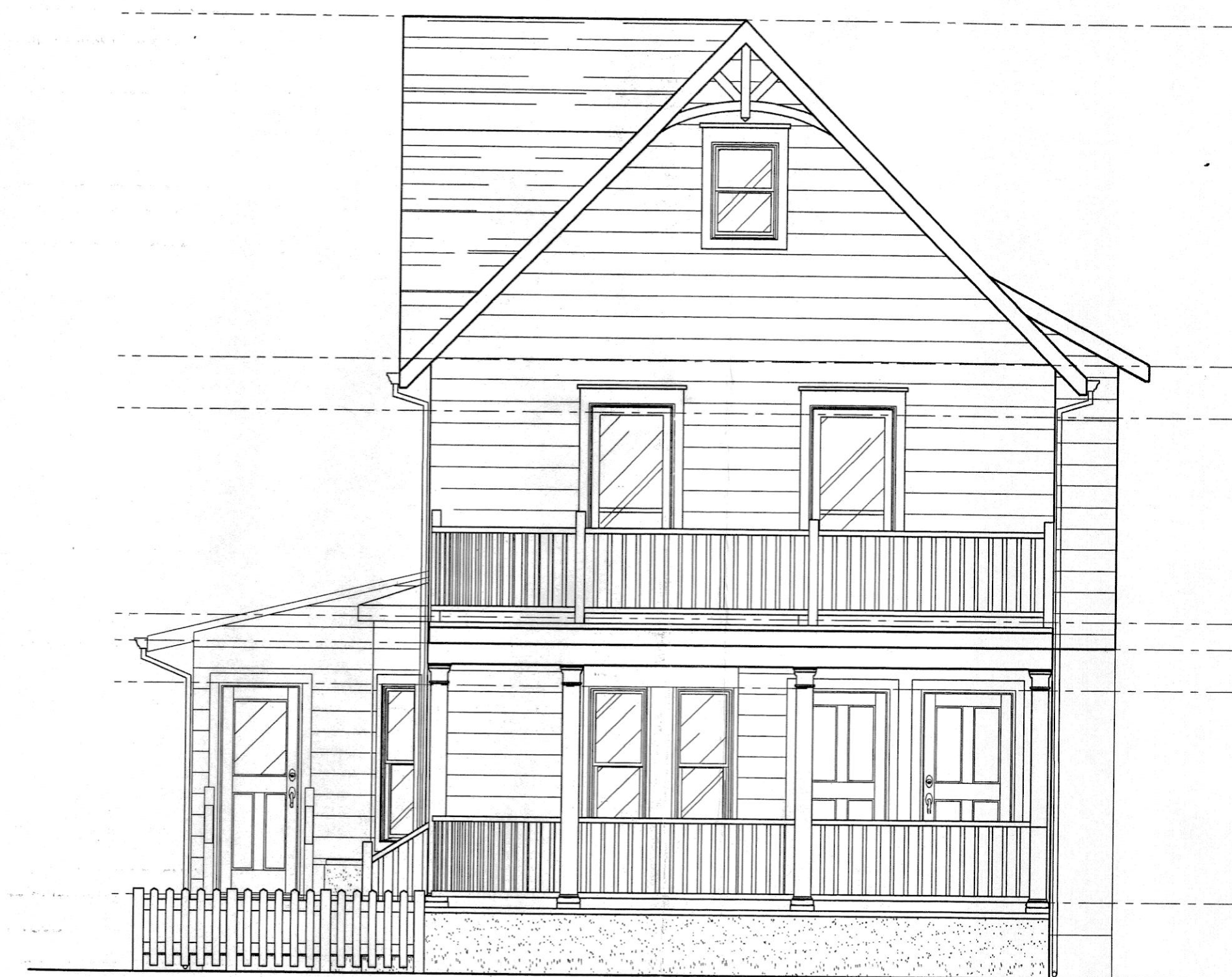
FRONT ELEVATION SCALE: 1" = 20'-0"

NOTIFY ARCHITECT IMMEDIATELY OF ANY DISCREPANCIES PRIOR TO THE START AND COMPLETION OF WORK.