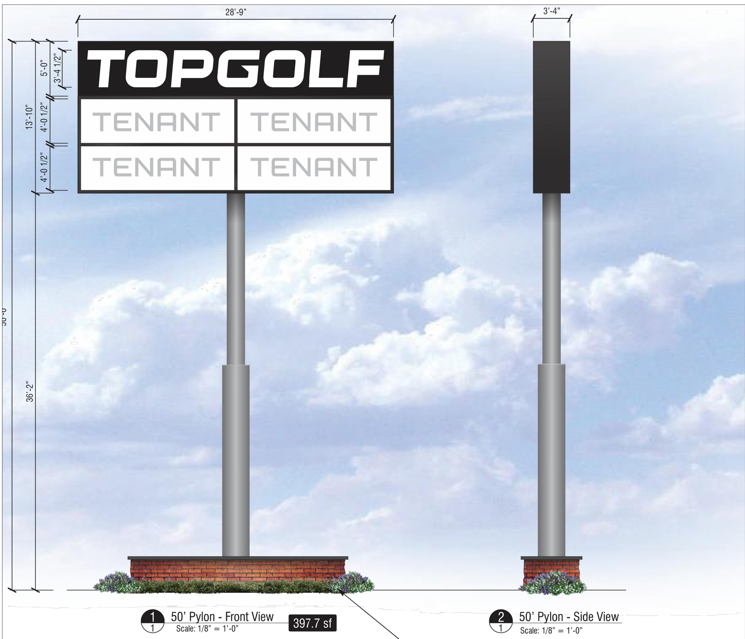
1 50' Pylon - Front View Scale: 1/8" = 1'-0" 397.7 sf