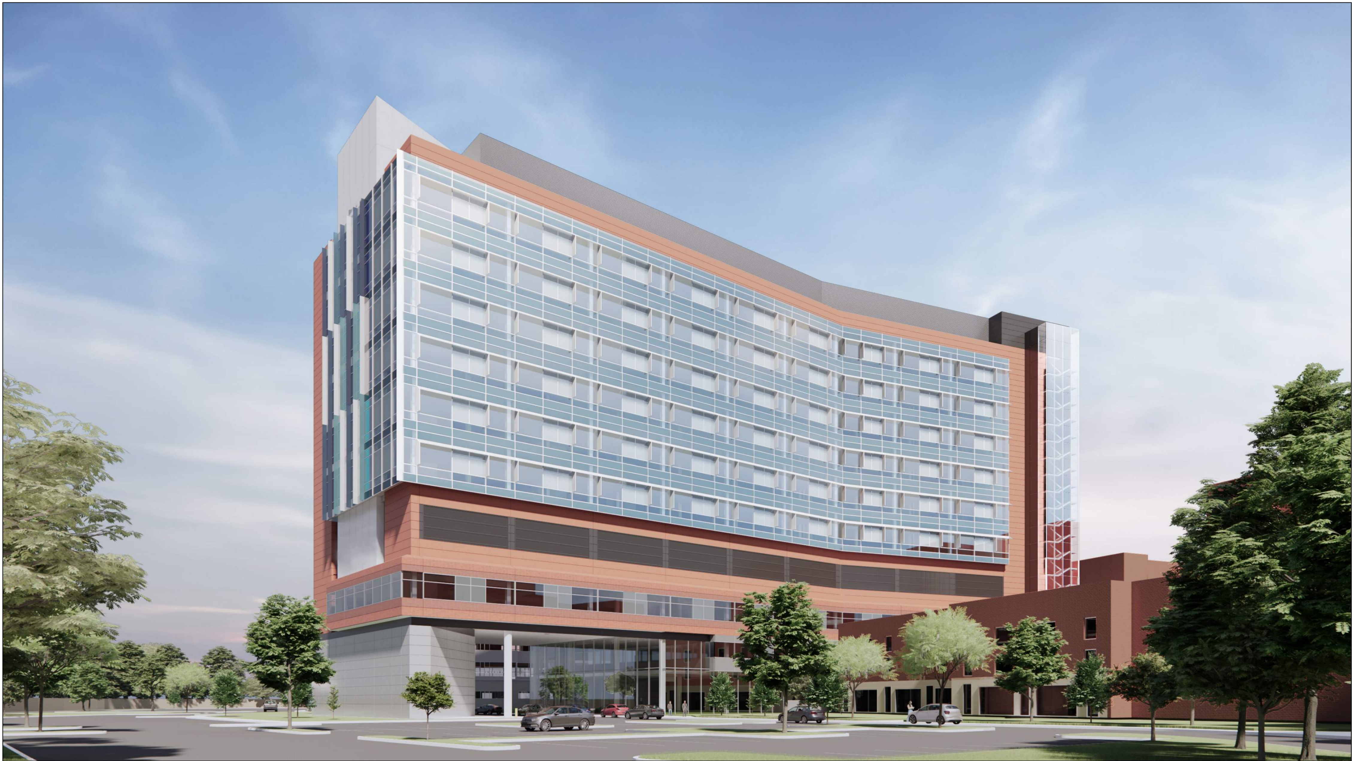
2 RENDERING VIEW FROM SOUTH SCALE: N.T.S.