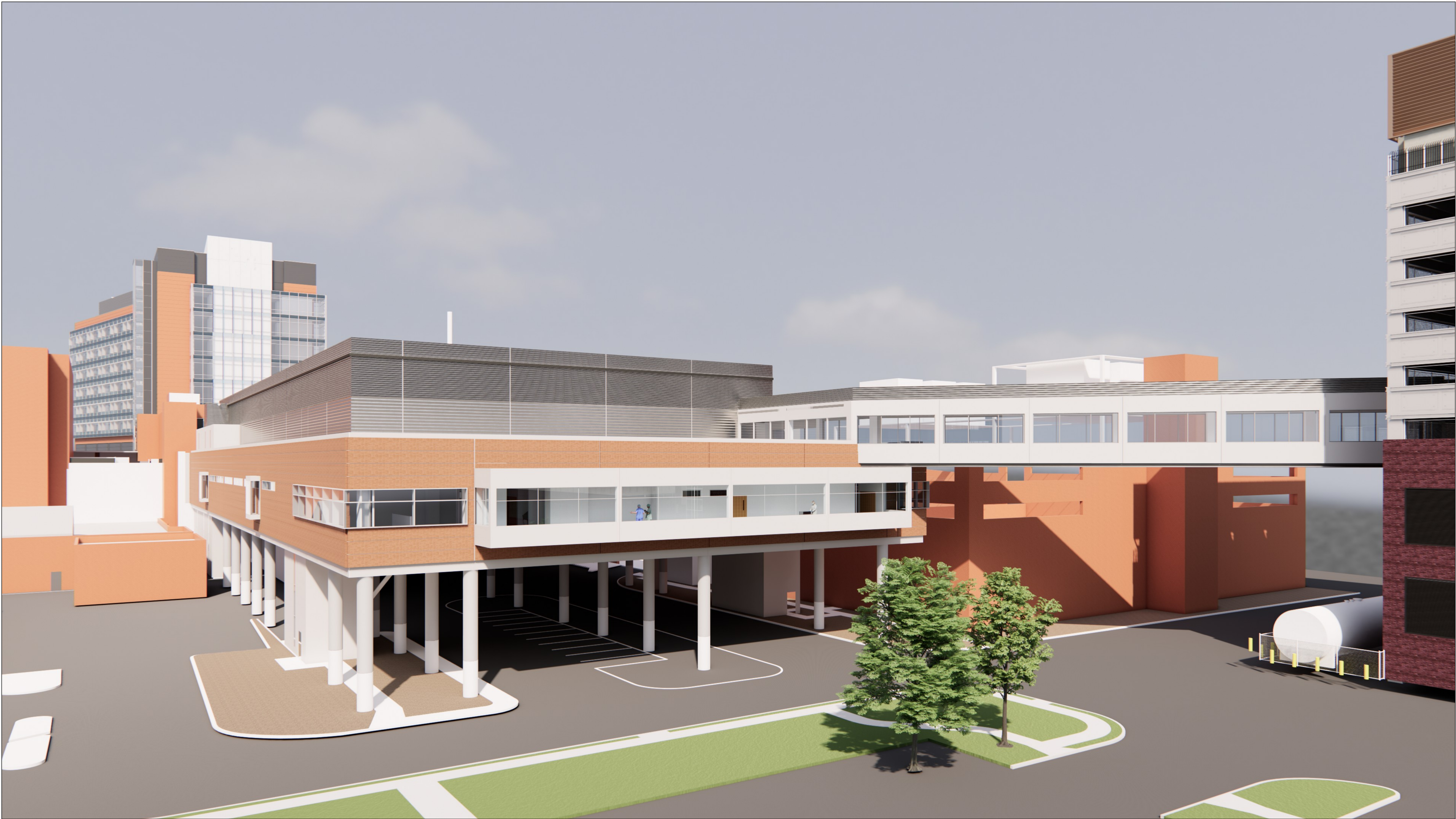
1 RENDERING VIEW FROM EAST SCALE: N.T.S.