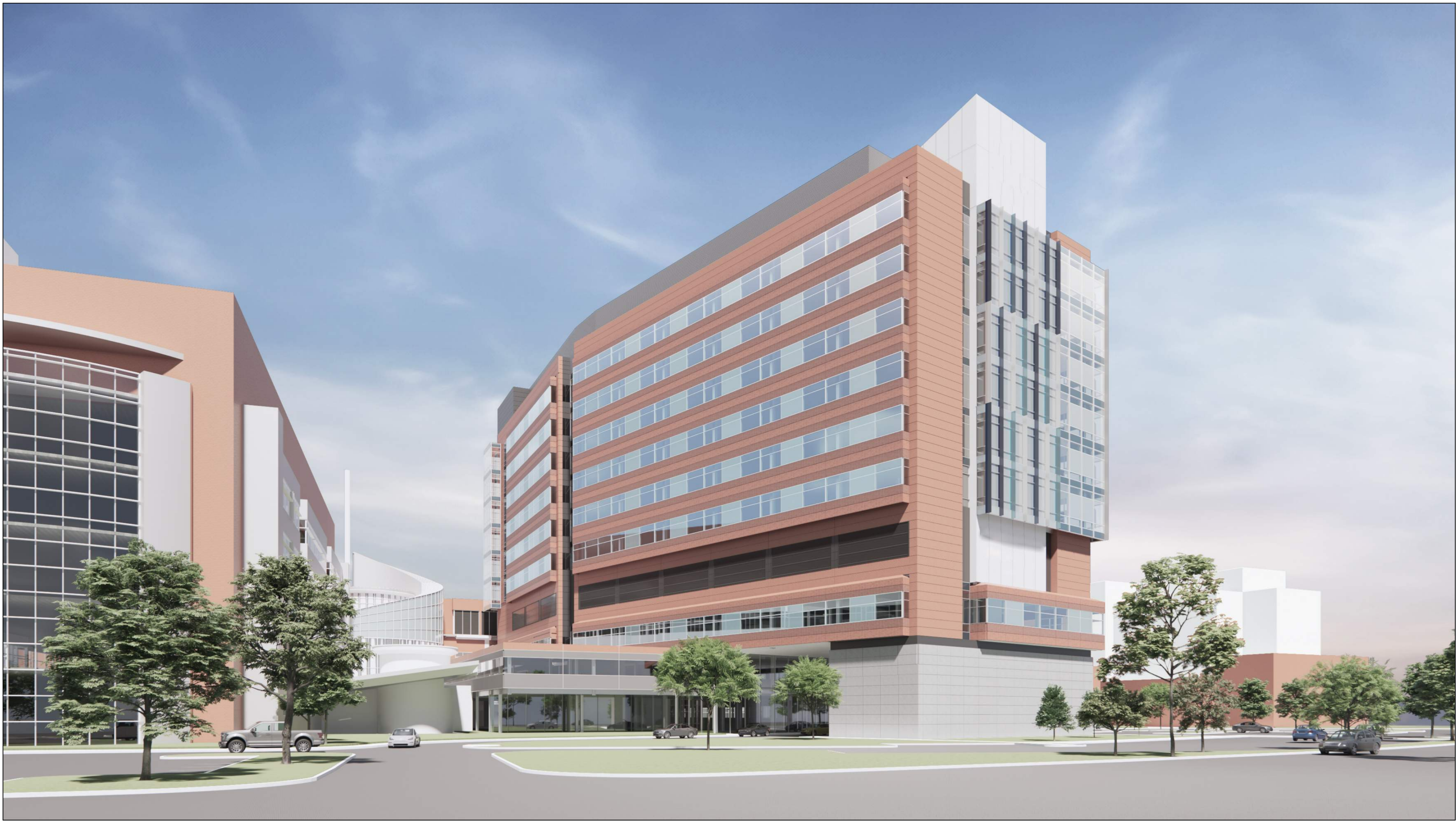
1 RENDERING VIEW FROM NORTHWEST SCALE: N.T.S.