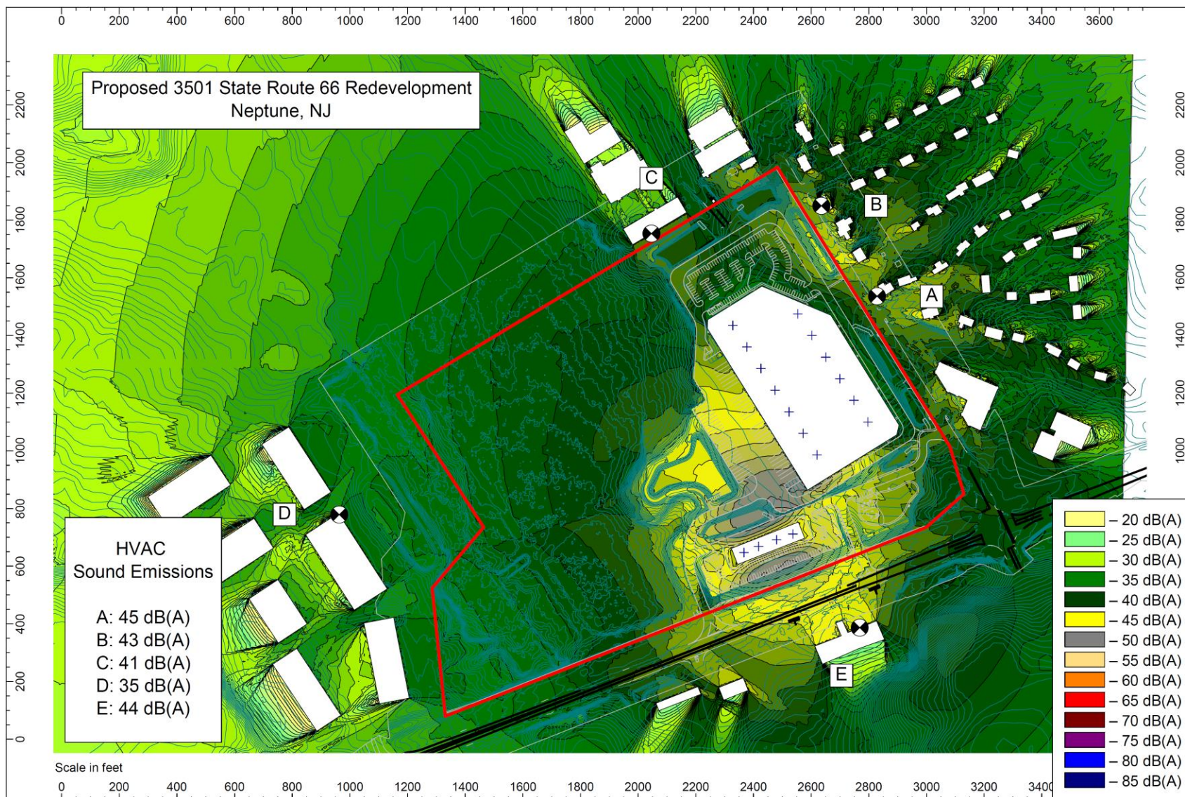
Figure 2 — A-weighted sound emission contours, 5 feet above grade, for sound from rooftop HVAC equipment. HVAC units shown with a blue + sign. Buildings shown in white, site property line outlined in red. Sound emissions tabulated at 20 feet above grade for all Locations.