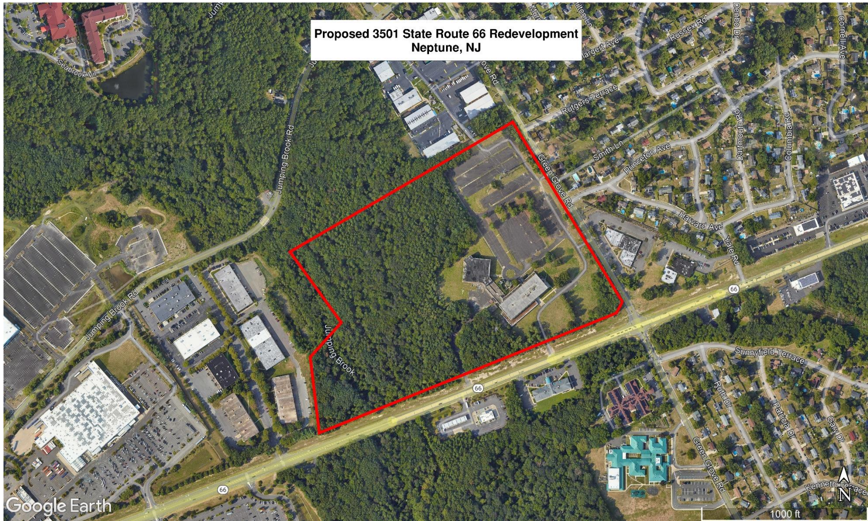
Figure 1 — Google Earth image showing the proposed 3501 State Route Redevelopment, Neptune, NJ. The site property line is approximately outlined in red.