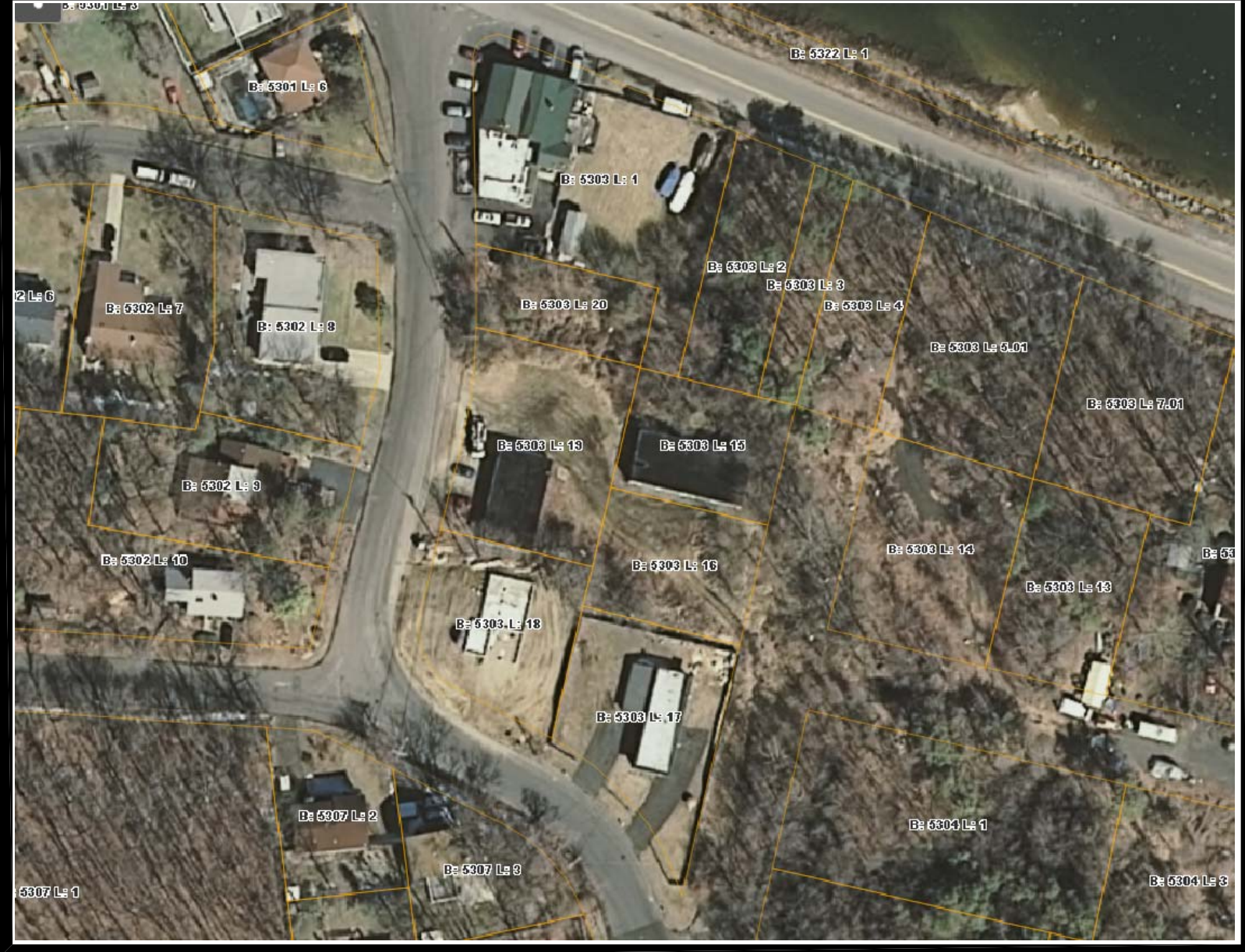
AERIAL PHOTO ~ NJDEP GEOWEB MAP VIEWER PHOTO 2007