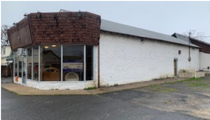
120 South main A-Building

On April 16, 2021 at your request, FABCO Plumbing and Heating LLC. (FABCO) conducted a geophysical tank location service at 448 West Park Ave Ocean Township New Jersey . The purpose of the work was to determine whether any subsurface geophysical anomalies suggestive of any underground storage tanks (UST) could be located outside the footprint of the residence, or visible oil feed lines or vent piping. FABCO used a Fisher Magna wand unit for subsurface detection to sweep for underground metal anomalies in areas of concern (AOC's) at the above reference Residence. FABCO investigated the residence areas of concern to the best of our ability.