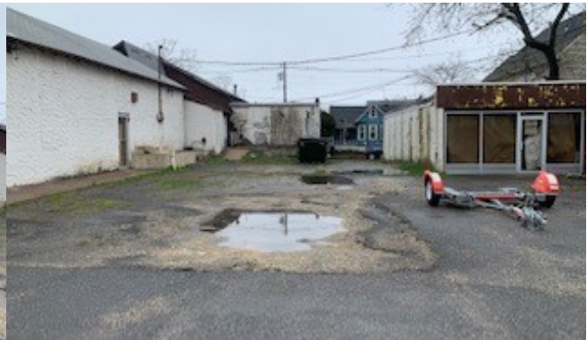
120 South main B-Building & Depression

Summary Conclusion: The exteriors of the property were examined for tank-like metal anomalies and associated piping such as oil feed or return lines or vent piping. FAB did not find an and evidence of and underground oil storage tank outside the footprint of the buildings. FAB did not find any evidence of oil lines or vent piping on the property. FAB is concerned about the depression in the parking lot, could be a possible former UST Excavation. Please review the Phase one for more information and data on property.