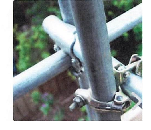
NYC SCA-201 4-Hour S Scaffolding User & Refl Construction

Fall Protection Awareness for Construction