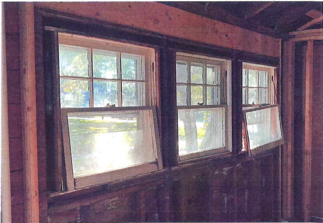
EVIDENCE THAT EXISTING WINDOWS WERE REPLACED WITHIN LARGER OPENINGS