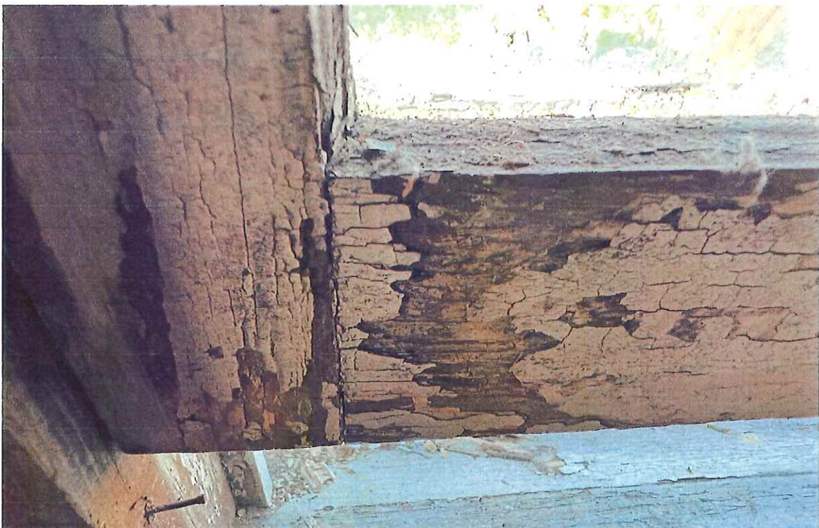
WINDOWS SASH AND FRAME HAVE BEEN PERMEATED WITH MOLD, FOUND TO BE SEVERELY COMPROMISED FROM WATER DAMAGE AND GENERALLY INOPERABLE WITH MISSING, RUSTED AND BROKEN HARDWARE