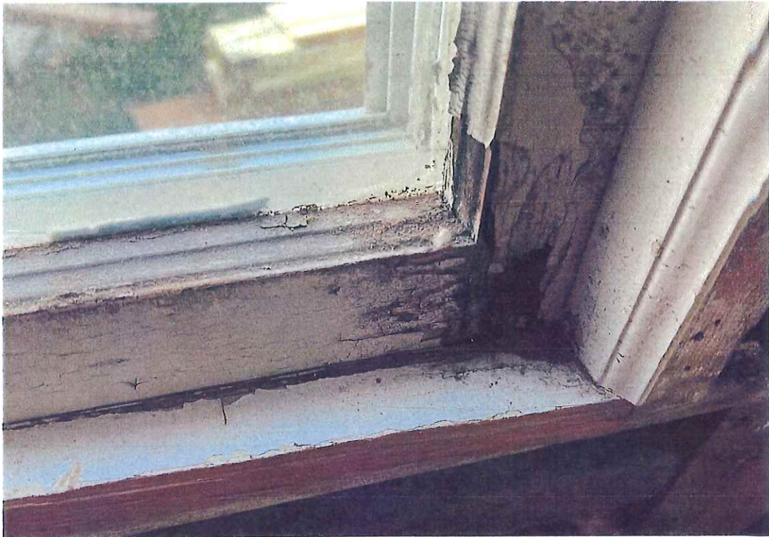
TYPICAL LOWER CORNER SASH WATER DAMAGED CONDITIONS