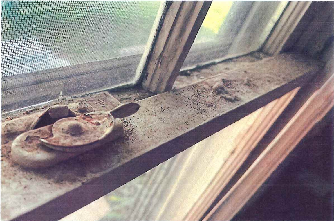
SASH MEETING RAILS ARE TYPICALLY MISALIGNED DUE TO DEFORMITY AND DEFECTS