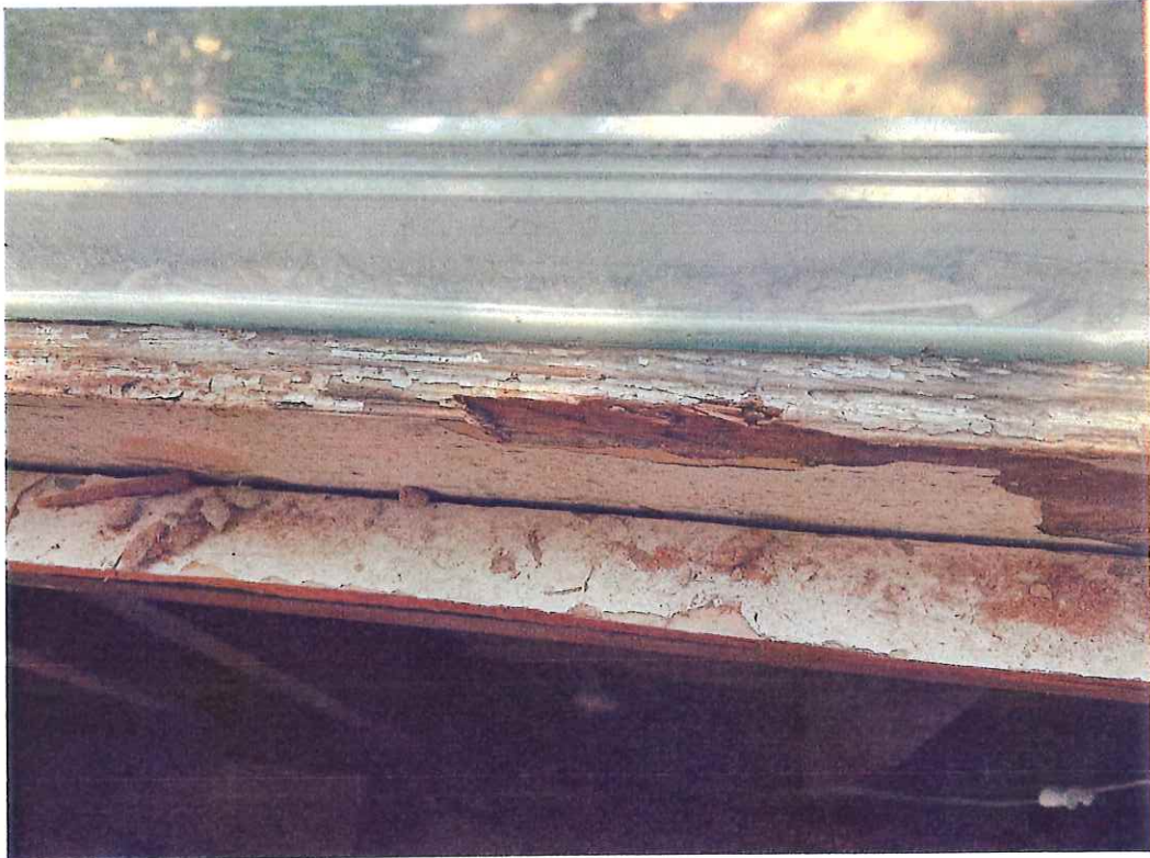
TYPICAL INTERIOR WOOD SASH CONDITIONS