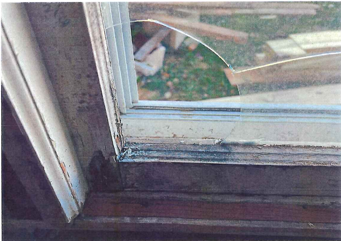
INTEGRITY OF SASH WOOD FIBERS AND CORNER JOINTS FULLY COMPROMISED