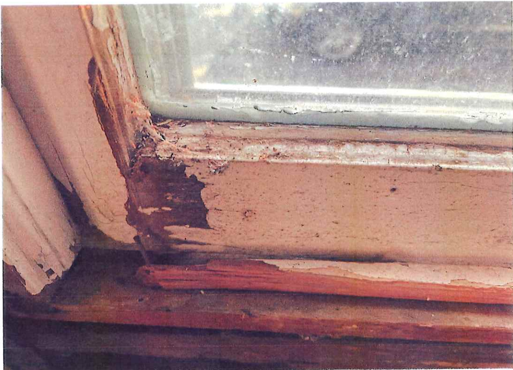
NOTED USE OF EXPOSED NAILS TO SECURE WINDOWS WITHIN JAMBS