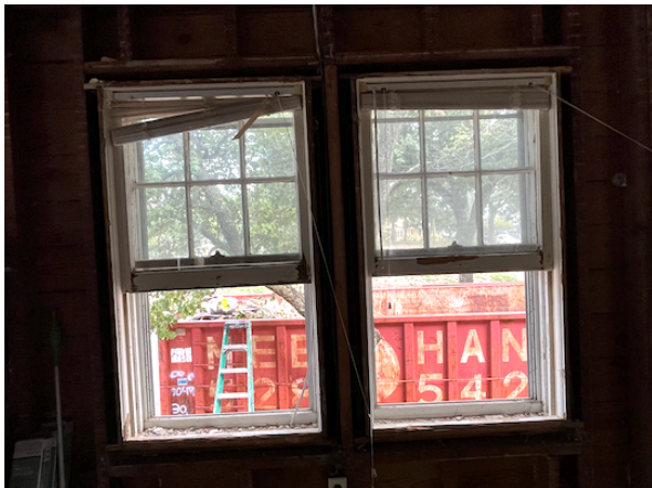
windows 5 and 6