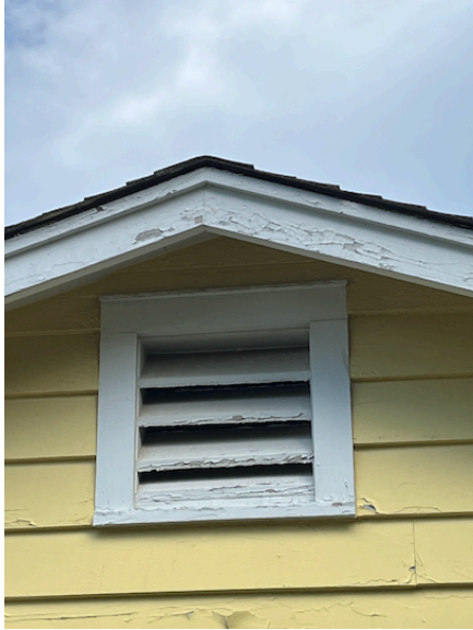
typical vent (in front/north gable)