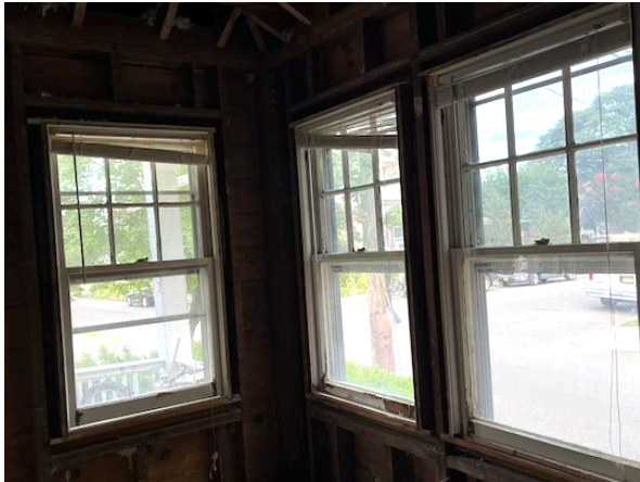
windows 2, 3, and 4