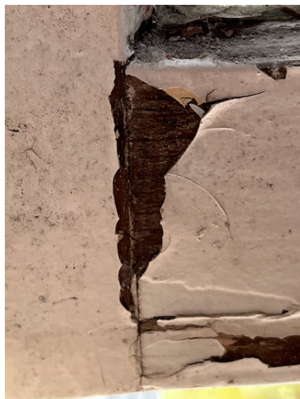
detail of typical chipped paint as on sash of 17