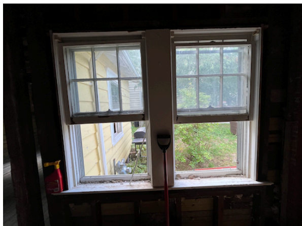
windows 17 and 18