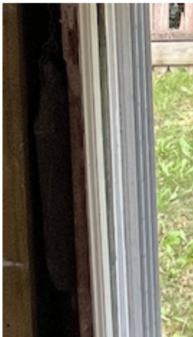
sash weight window 15