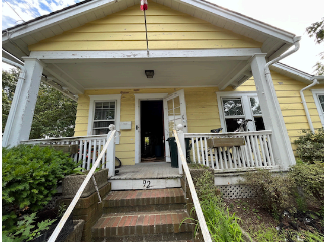
window 2, front door 1, windows 22 and 23