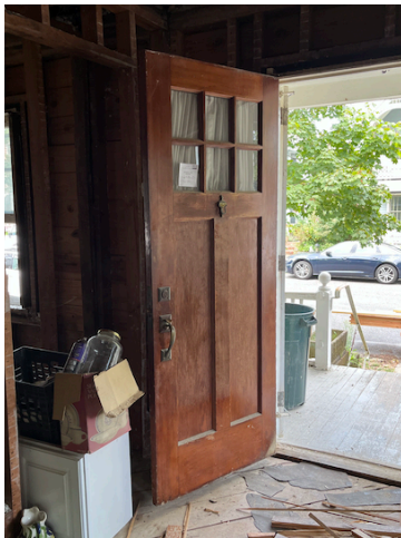
front door (1 on key)