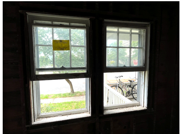
windows 22 and 23