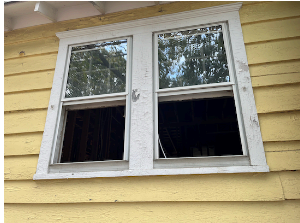
windows 3 and 4 (typical exteriors)