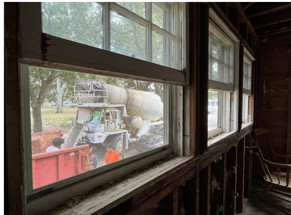
windows 7, 8, and 9