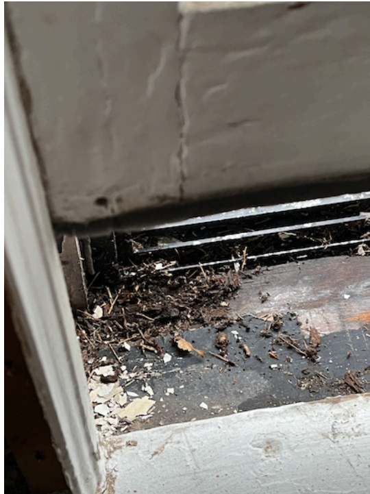
rot in sills of two second-floor windows