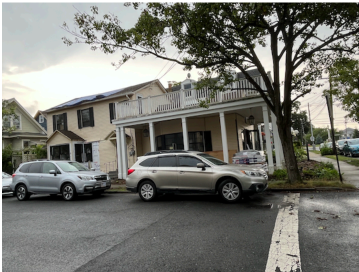
view of east side of house