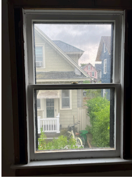
examples of second-floor windows