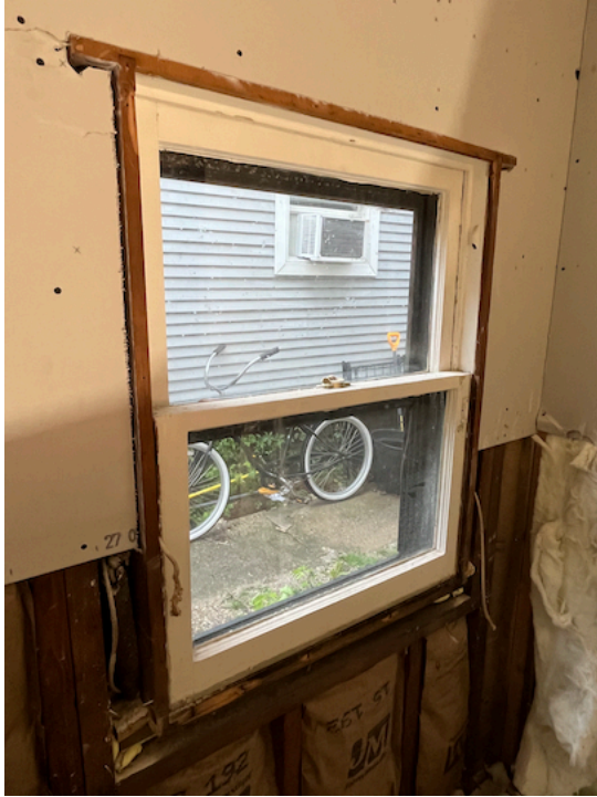
example of first floor window in bedroom in southwest corner