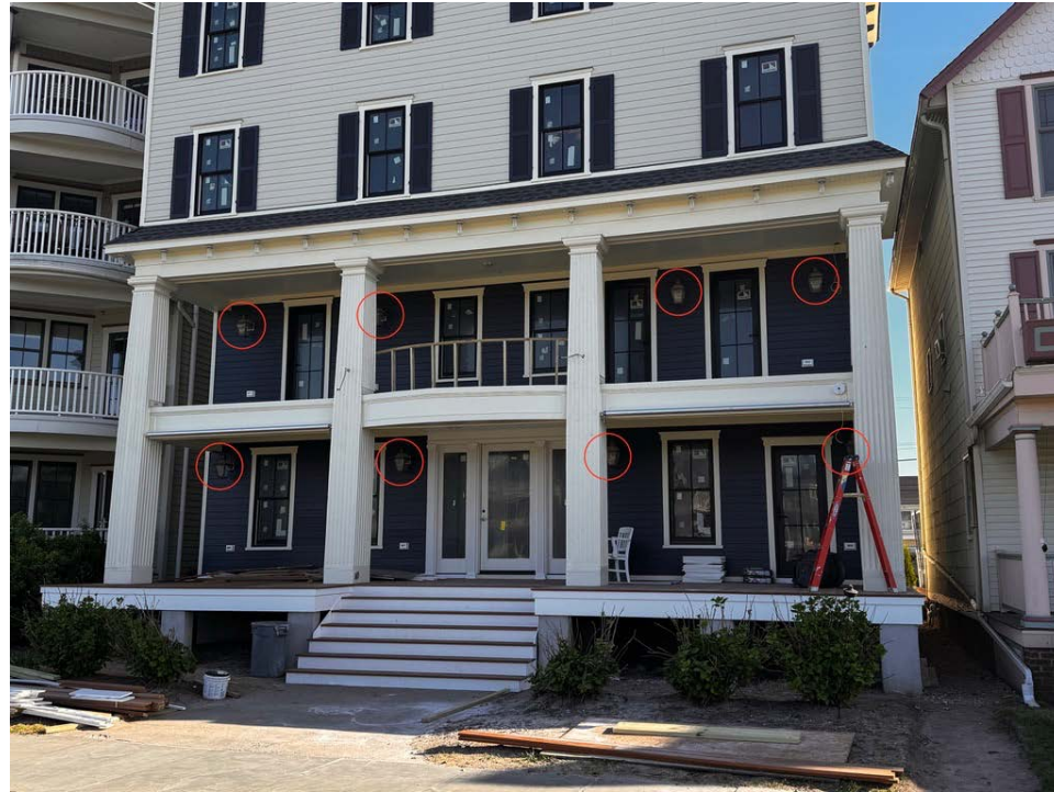
The Albatross with the same size Bevolo lanterns along the front porches.