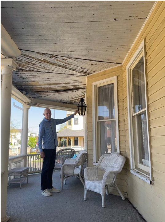
A full-scale model of proposed fixture.