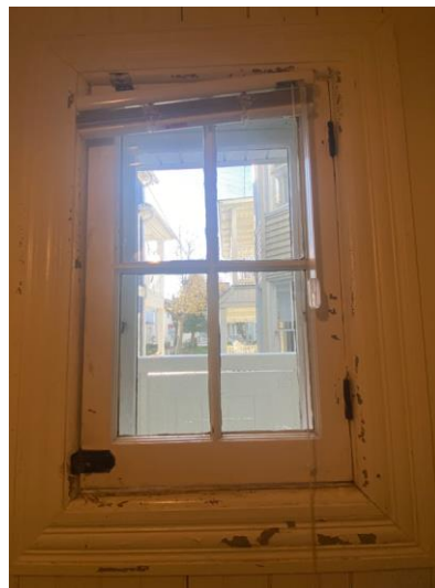
Existing conditions of Window 109 scheduled to be removed and infilled.