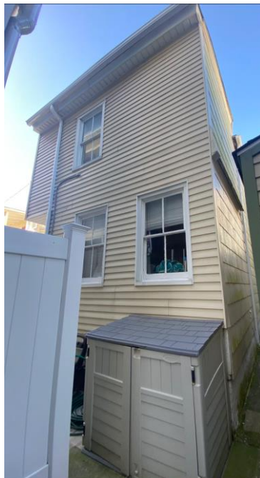
SIDE ELEVATION (EAST)

Shore Point Architecture, PA 108 South Main Street Ocean Grove, NJ 07756 P: 732. 774.6900 F: 732.774.7250