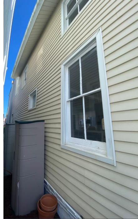
SIDE ELEVATION (WEST)