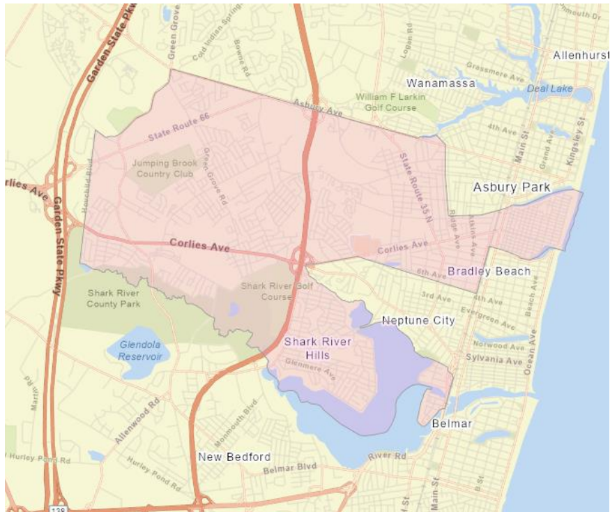
Figure 1. Municipal Boundaries

As of the 2019 American Community Survey 5-year estimates, there were 27,563 people, a 1.35% decrease since its 2010 population. There were 11,402 households, 6,945 families residing in the Township. The racial makeup of the Township was 55.0% (15,158) white, 34.4% (9,482) black or African American, 0% Native American, 2.4% (672) Asian, 3.7% (1,014) from other races, and 4.5% (1,228) two or more races. Hispanic or Latino of any race were 10.6% (2,918) of the population. In the Township,