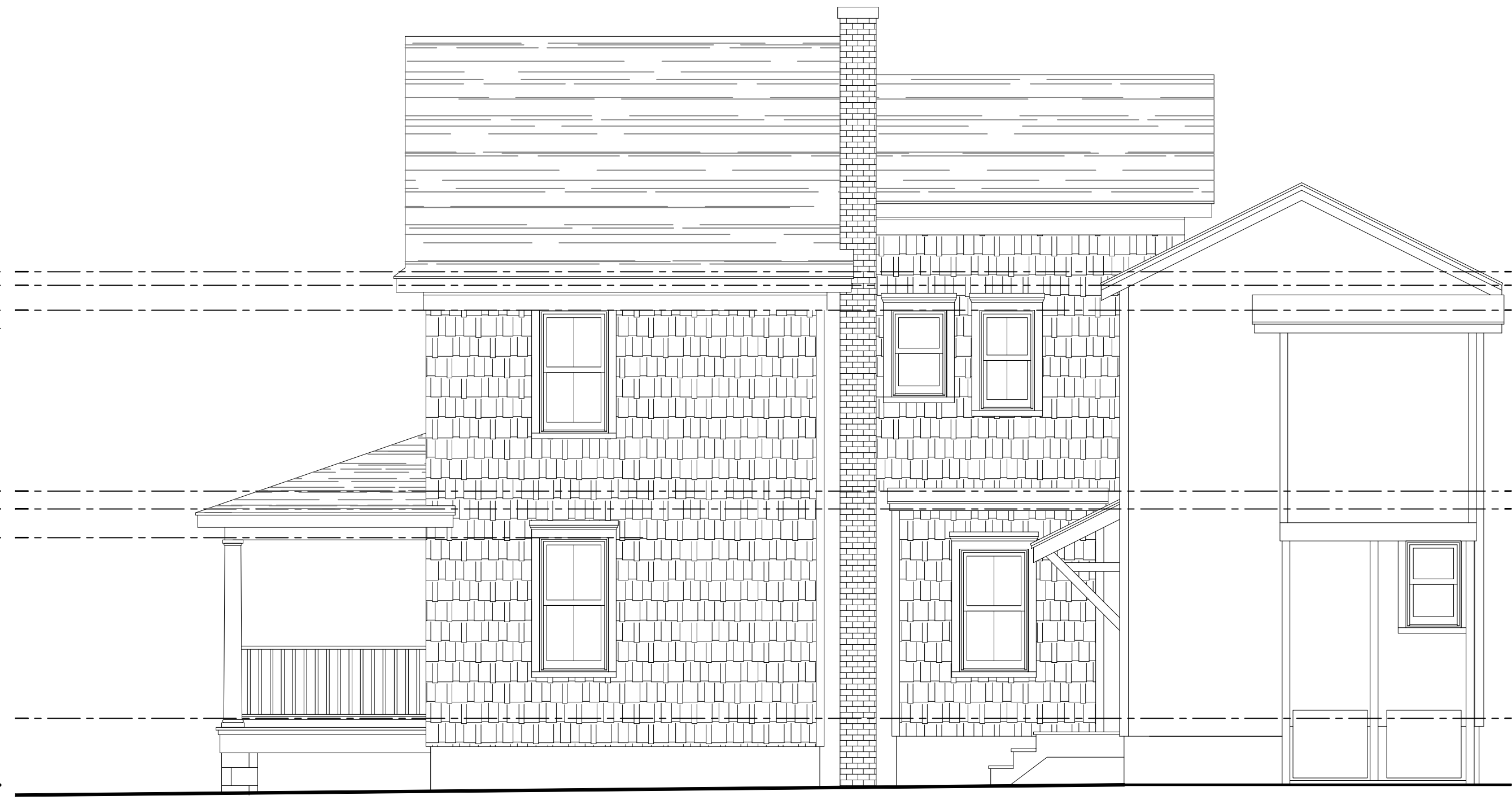
B A-2 EXISTING RIGHT SIDE (EAST) ELEVATION SCALE: 1/4" = 1'-0"