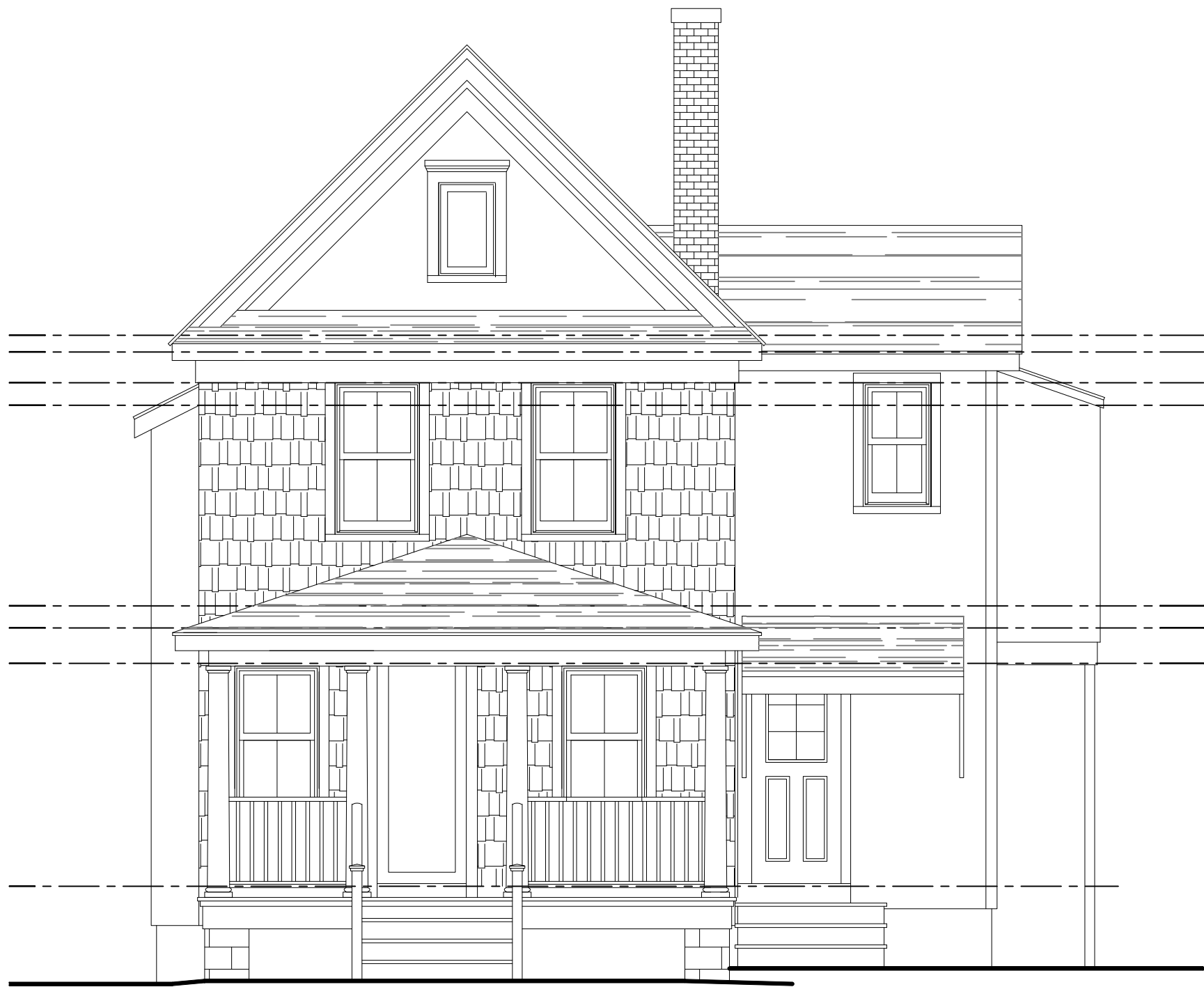
A A-2 EXISTING FRONT (SOUTH) ELEVATION SCALE: 1/4" = 1'-0"