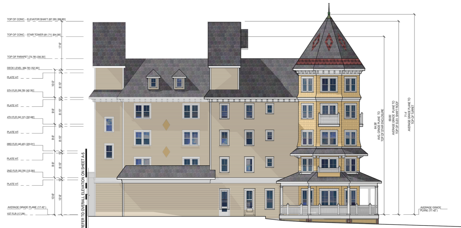
NOTE * (INDICATES ELEVATION ABOVE SEA LEVEL) (INDICATES ELEVATION ABOVE AVERAGE GRADE PLANE) ② HOTEL - WEST ELEVATION 1/8"=1'-0"