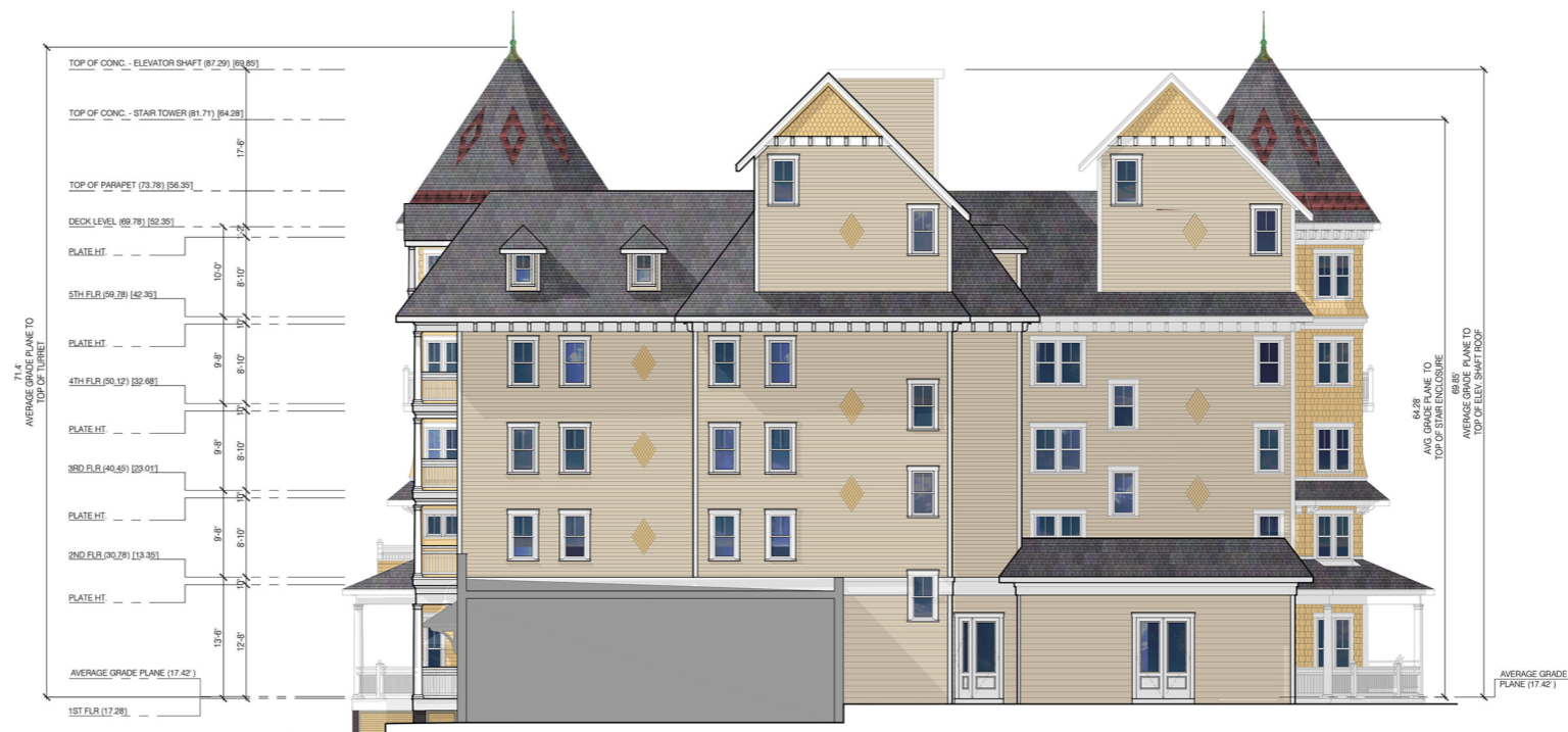
NOTE * (INDICATES ELEVATION ABOVE SEA LEVEL) (INDICATES ELEVATION ABOVE AVERAGE GRADE PLANE) ① HOTEL - NORTH ELEVATION 1/8"=1'-0"