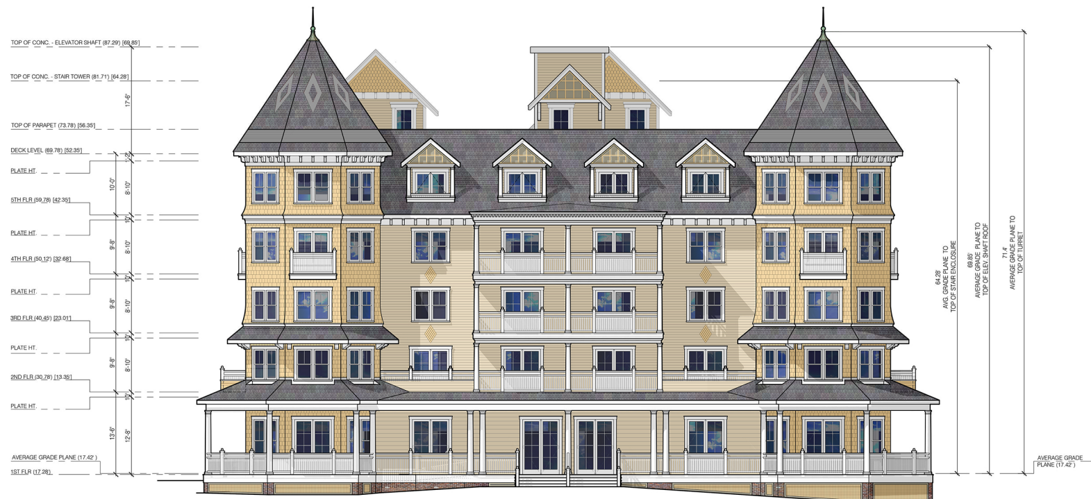
① HOTEL - SOUTH ELEVATION 1/8"=1'-0"

NOTE (INDICATES ELEVATION ABOVE SEA LEVEL) (INDICATES ELEVATION ABOVE AVERAGE GRADE PLANE)