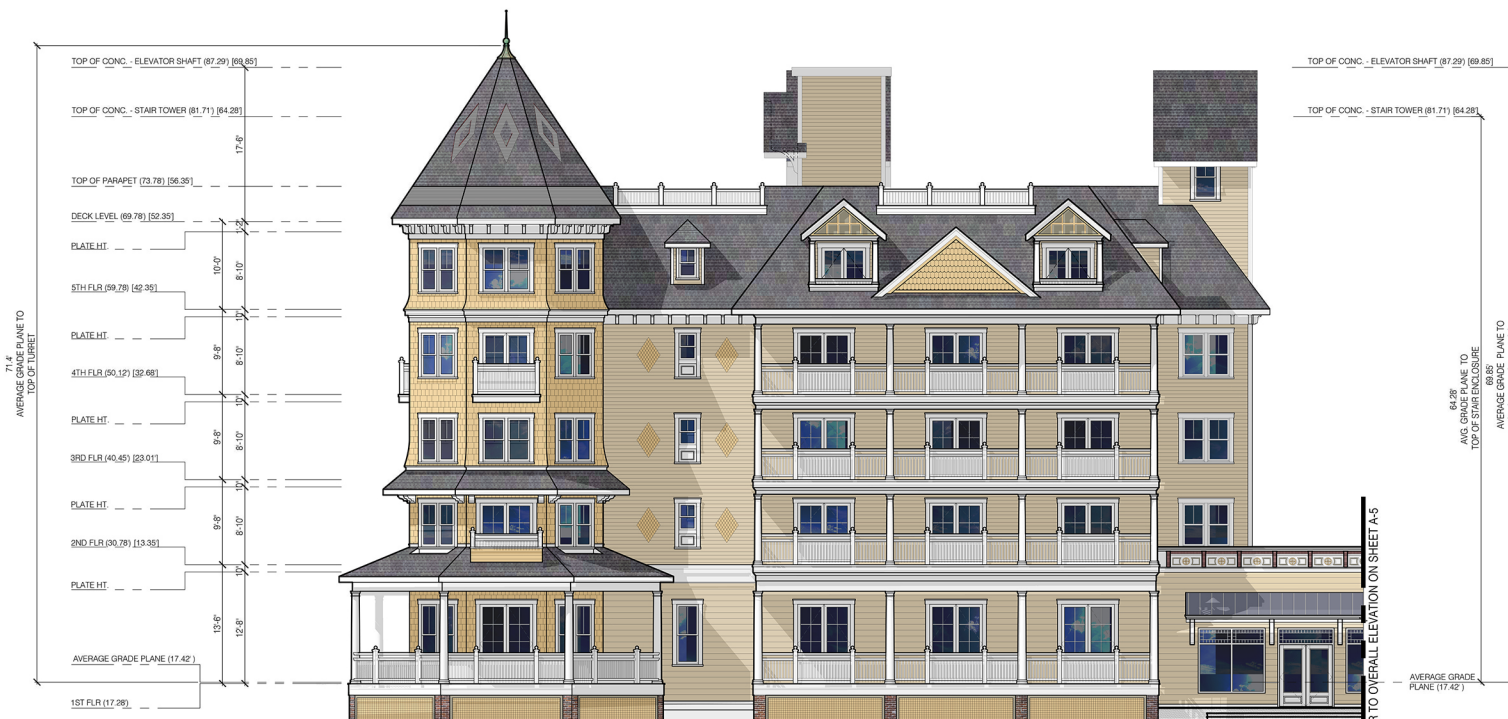
② HOTEL - EAST ELEVATION 1/8"=1'-0"

NOTE (INDICATES ELEVATION ABOVE SEA LEVEL) (INDICATES ELEVATION ABOVE AVERAGE GRADE PLANE)