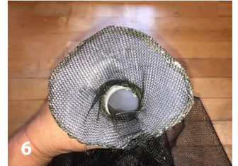
5. A section of the screening should overlap to keep the insects from escaping. 6. If you are using flexible screening that can't support itself, use hot glue to attach the screening to the plastic top.