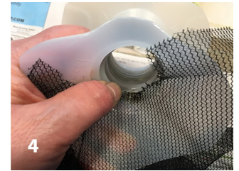
3. Fold insect screening and cut a small half-circle out at the top. 4. Attach top of the cut half-circle of the insect netting with hot glue. This is the hardest part—you have to tack it and wait until the glue dries and then tack it again, working slowly all the way around.