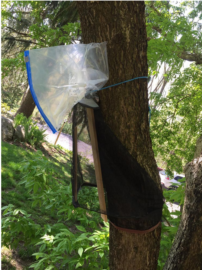
Circle trap secured to a tree.

It is almost time to use traps or sticky bands to protect your trees from spotted lanternflies. Get ready now so you can trap lots of spotted lanternflies safely.