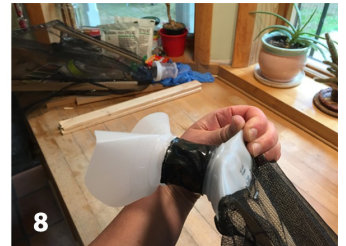
7. Staple the longer piece of wood to the netting and to the plastic top. 8. Fold the plastic top piece to direct the top of the tunnel more horizontal. Crease the plastic of the other top to make the top of the tunnel sturdy.