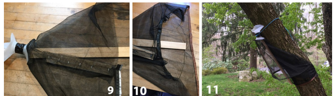
9. Staple the shorter piece of wood to the netting. Tack the top part of the seam with an office stapler so the SLF can't escape through the seam.

10. Use an office stapler to attach the wire to the side of the netting that has the shorter piece of wood. This will hold the outer part of the skirt away from the tree trunk and keep the entrance to the trap open. You will have to adjust the wire to make it fit the tree. 11. Tie the top of the trap to the tree trunk. Use push pins or a staple gun to secure the bottom edge of the netting securely against the tree.