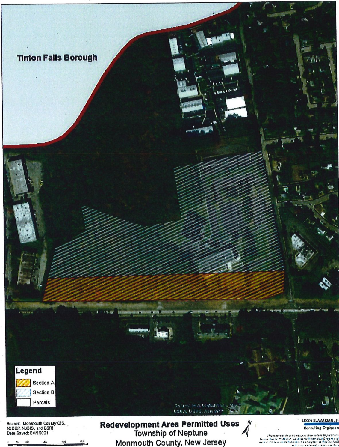
Figure 4. Redevelopment Area Permitted Uses